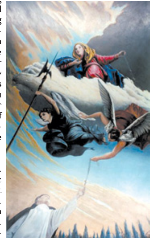
St. Dominic reaches for the Rosary - the great spiritual weapon.

With his weapons, while he waited, Dominic had fought under a great captain, his Bishop Diego, begging his bread from door to door, preaching, discussing; and recollecting themselves at the foot of that Albigenian citadel