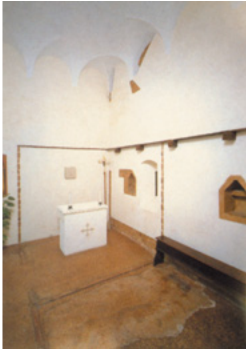
Cell where the Saint died Bologna, 6 August 1221

From this altar whose century-old glory is so dazzling and on which Dominic’s head is exposed in an exquisite reliquary for the devotion of the faithful, he speaks, almost prophecies; he is addressing us as well. “May the bones of the ... prophets also send forth new life from the ground where they lie” (Ecclus 49:10). In the first place it is to you that he speaks, generous and worthy sons of so great a Patriarch, who as athletes of the faith and lights of the world have learned and are learning from him to run in his footsteps, as much by example of the most evident virtue as by speech. He is your glory, just as his crown is your illustrious company gathering palms and laurels from age to age down through the centuries. “Grandchildren are the crown of old age, and sons are proud of their fathers” (Prov 17:6). If about this altar, under the vaulting of this church, the centuries were to reassemble the noble ranks of Preachers, amid the splendor of its Popes and Cardinals, how