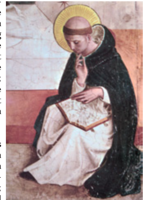
St. Dominic contemplating the scriptures. (by Fra Angelico)

What were the subjects the two friends discussed in their colloquies, each in turn enkindling the other's devotion? That is God's secret; but if history does not record them, subsequent events would loudly proclaim them.