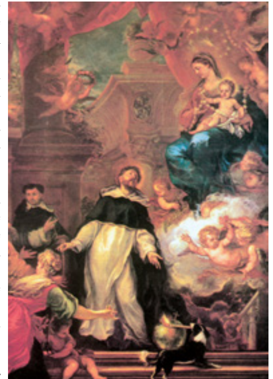
Apparition of the Virgin Mary to St. Dominic. (by Coello)

Yes, oh glorious Patriarch, we invoke you. Fragrant lily from the virginal vales, indefatigable herald and propagator of faith and truth, father of unconquerable champions and admirable Masters of the flock of Christ, you know how to persuade gently and sweetly, to encourage in every virtue. Since you have been and still remain an incomparable teacher of the sons you have chosen, be also our Master in the true paths of doctrine leading to salvation! Destroy in our minds the senseless wisdom of the world,