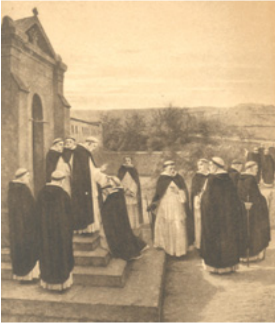
St. Dominic Blesses and then sends forth his first Brethren

commands, correct and overcome themselves in trials which the example of their father softened and rendered attractive in the eyes of his sons, when it was a question of gaining a challenging victory over self? I can see them gathered around their beloved father in the convent of St. Romain in Toulouse, on the feast of Mary's Assumption in 1217. It was a memorable day when Dominic, after having his